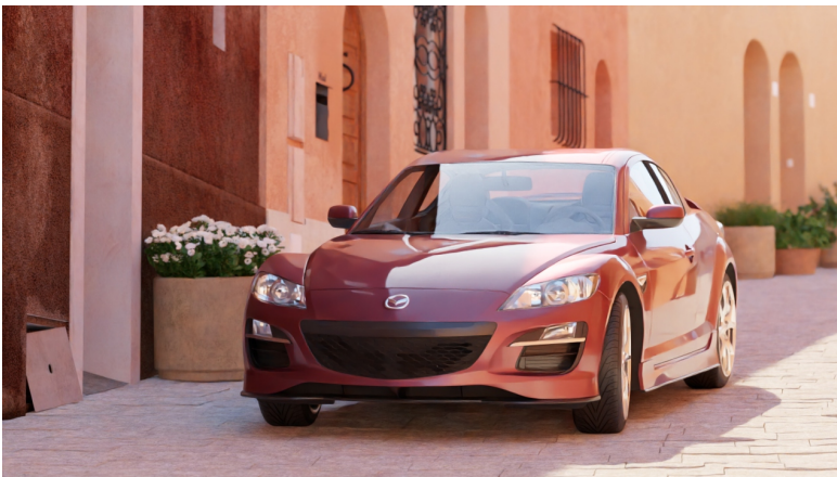
Figure 3.2 – Example output image denoised using clean auxiliary feature images (albedo and normal).

It accepts either a low dynamic range (LDR) or high dynamic range (HDR) color image as input. Optionally, it also accepts auxiliary feature images, e.g.