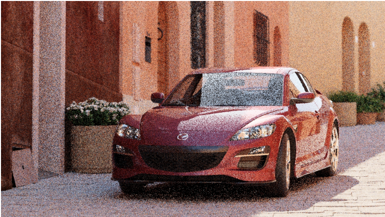
Figure 3.1 – Example noisy color image rendered using unidirectional path tracing (4 samples per pixel). Scene by Evermotion.

The RT (ray tracing) filter is a generic ray tracing denoising filter which is suitable for denoising images rendered with Monte Carlo ray tracing methods like unidirectional and bidirectional path tracing. It supports depth of field and motion blur as well, but it is not temporally stable. The filter is based on a convolutional neural network (CNN), and it aims to provide a good balance between denoising performance and quality. The filter comes with a set of pre-trained CNN models that work well with a wide range of ray tracing based renderers and noise levels.